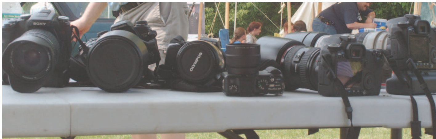
LV Photography Club Member Cameras

There was no Executive Board meeting this month.