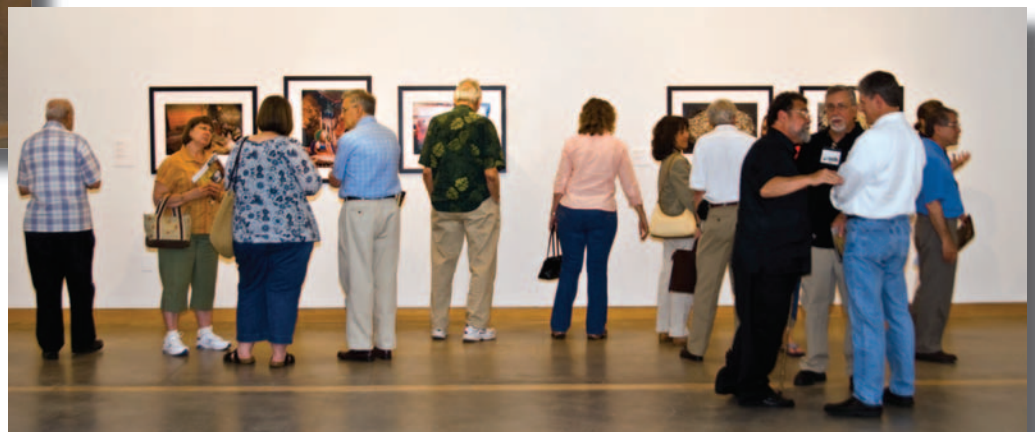
Right: Photo Credit Ricky Mensch