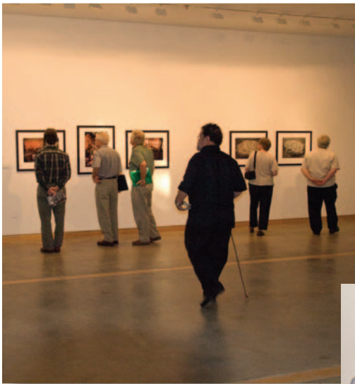
Above: Photo Credit Lee Levin-Friend

You can't reinvent the wheel but that doesn't mean you can't paint it a different color. ~ Ricardo Viera