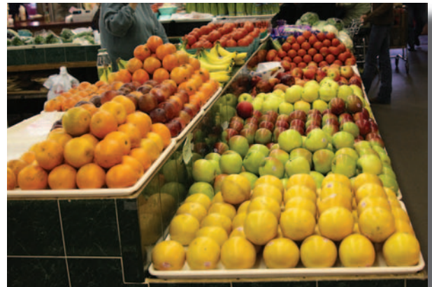
Tom Grim ~ Fruit Stand