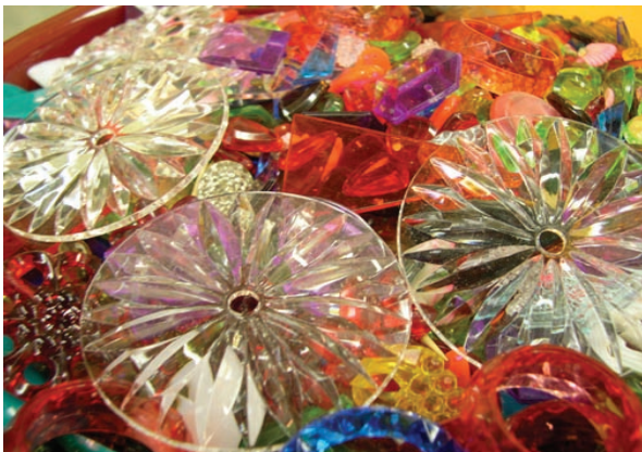
Loretta Killan ~ 1950s Lucite Pieces