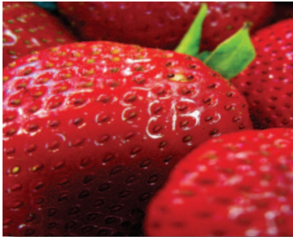
Jeff Grim ~ Strawberries