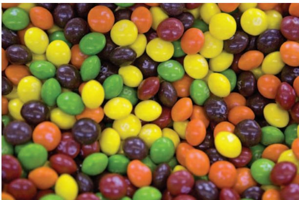
Alice Lipe ~ Taste the Rainbow